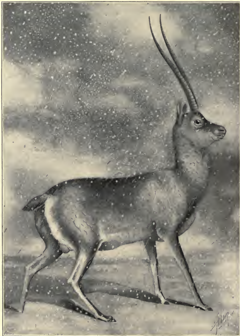
FIG XVI. PANTHOLOPS HODGSONI. THE CHIRU.